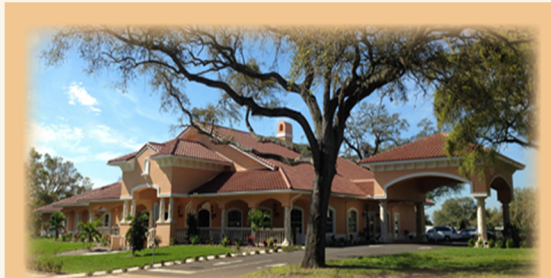
Mother Couderc Retreat House

The retreat will take place at the Mother Couderc Retreat House, located on the grounds of Our Lady of Divine Providence House of Prayer.